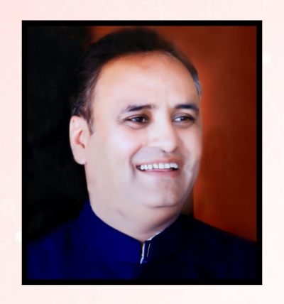
Shri Arun Yadav Former State Minister Of Central Govt. of India Chairman of the College Trust