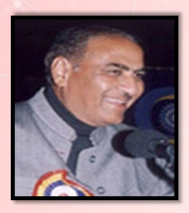
Late Shri Subhash yadav, Ex. Deputy Chief minister MP Govt. Patron