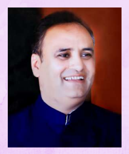
Hon'ble Arun Yadav Chairman, GBYSS Mahavidyalaya & Former Minister of State, Heavy Industries & Public Enterprises, Govt. of India