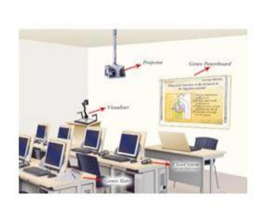
Fig. 3: Depicts the View of A Smart Classroom.